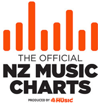
CHART RULES (as at November 2023)